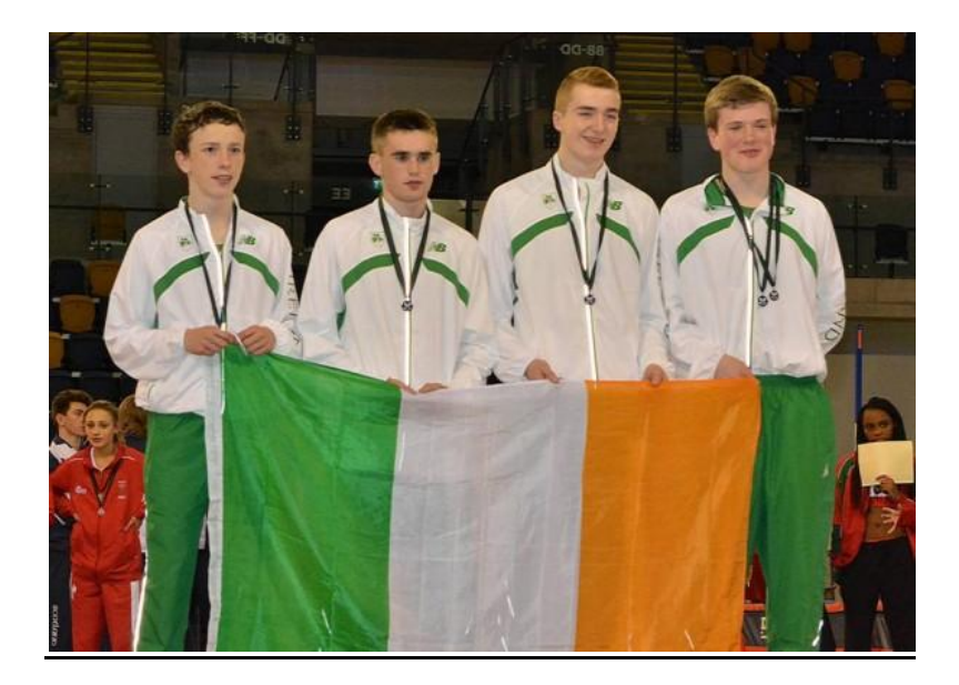
Irish Junior Boys team who won Silver