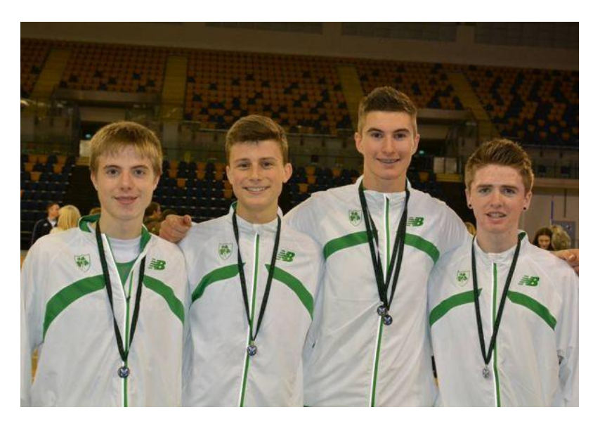
Irish Intermediate Boys team who won Silver