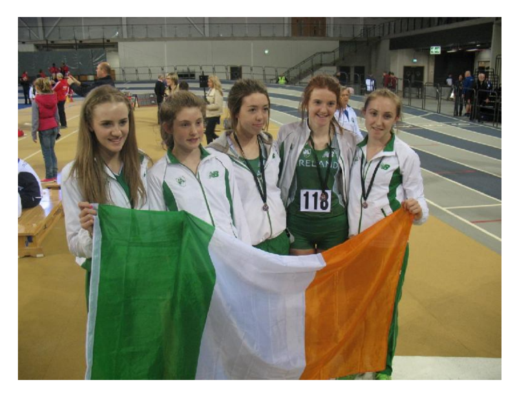
Irish Junior Girls team who won Bronze