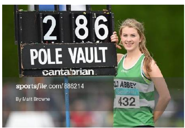
Some of our Munster Record Breakers pictured above.

In the Track Events, there was a 1 & 2 for Munster athletes in the Girls U/13 60mH, a 2 & 3 in Boys U/13 60mH, 2^{nd} & 3^{rd} in the Boys U/13 80m & Girls U/14 80m, 1^{st} & 3^{rd} in Boys U/14 80m, 1^{st} & 3^{rd} in Boys U/18 100mH, 2^{nd} & 3^{rd} in Girls U/19 100mH & a clean sweep in the Girls U/18 100mH.