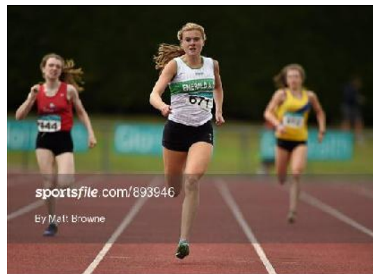
Some of our Munster Record Breakers pictured above.