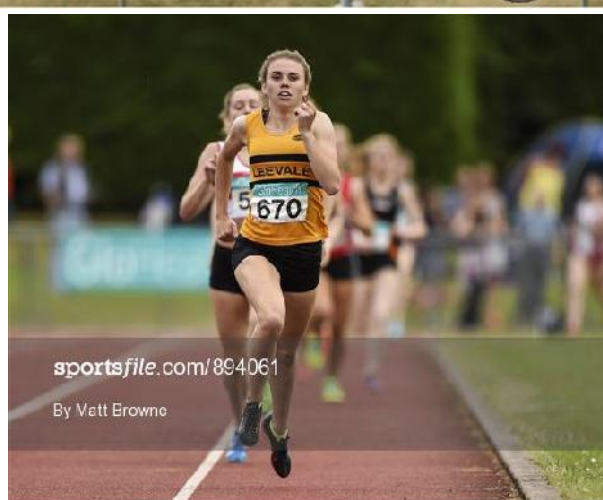
Some of the Munster medal winners from the weekend pictured above.

See Munster medal winners from Day 4 of the Championships below:-