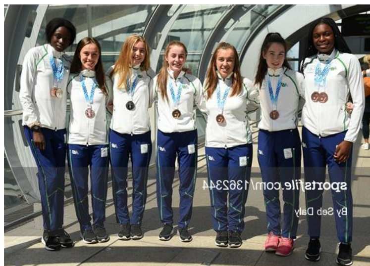
EYOF Medallists 2017